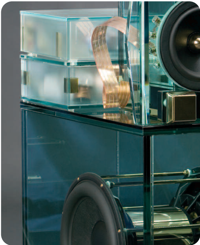
▼ THE AMP 1000 SUBWOOFER EDITION and THE FORCE subwoofer