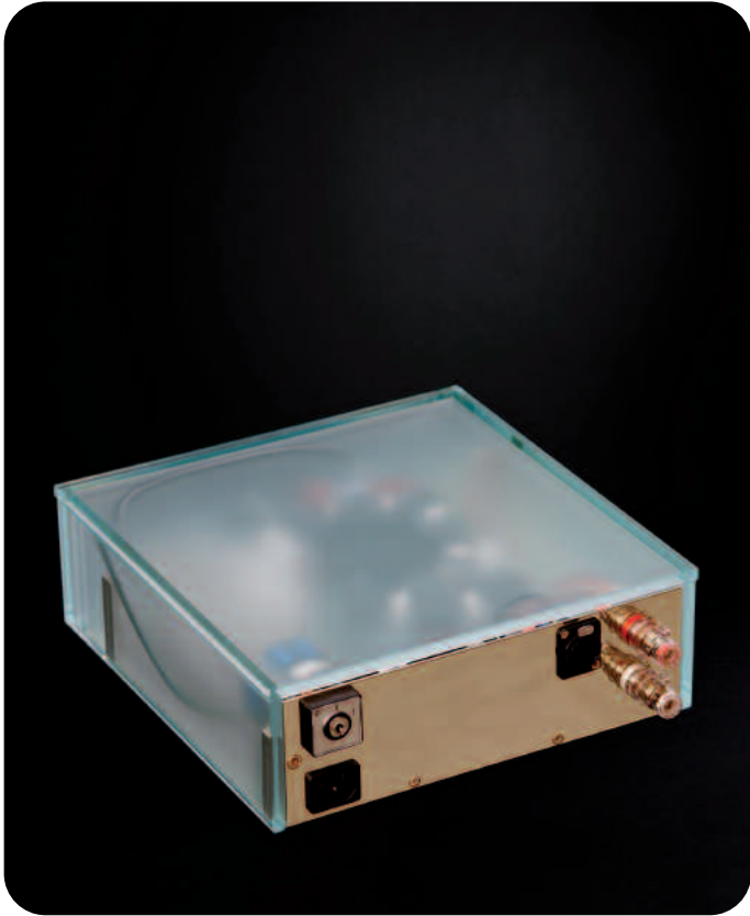
▲ THE AMP 1000 SUBWOOFER EDITION