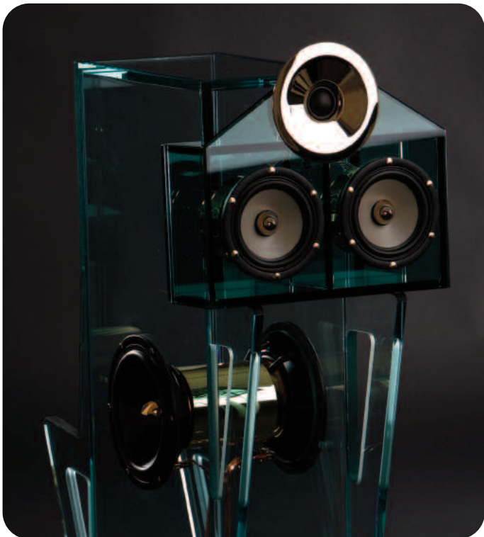
▼ THE FORCE CENTER 9:16 position