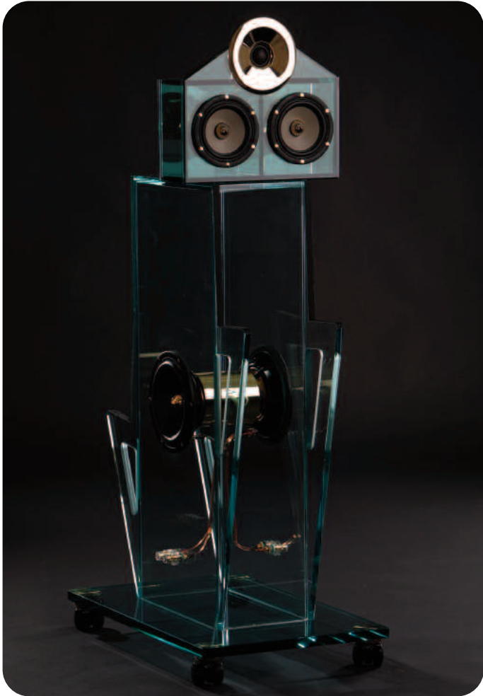
▲ THE FORCE CENTER