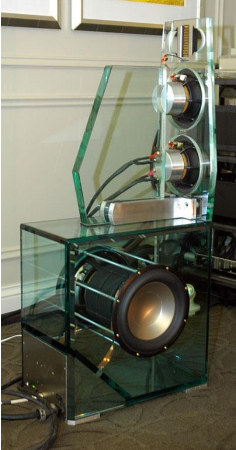
A shot of the rear of the Perfect8