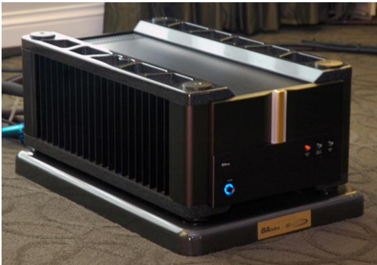
The impressive looking and sounding BALabo BP-1 Mk II stereo amplifier